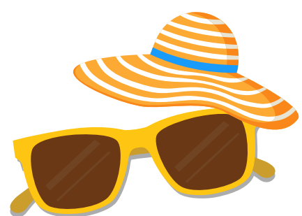
Sunglasses & cap