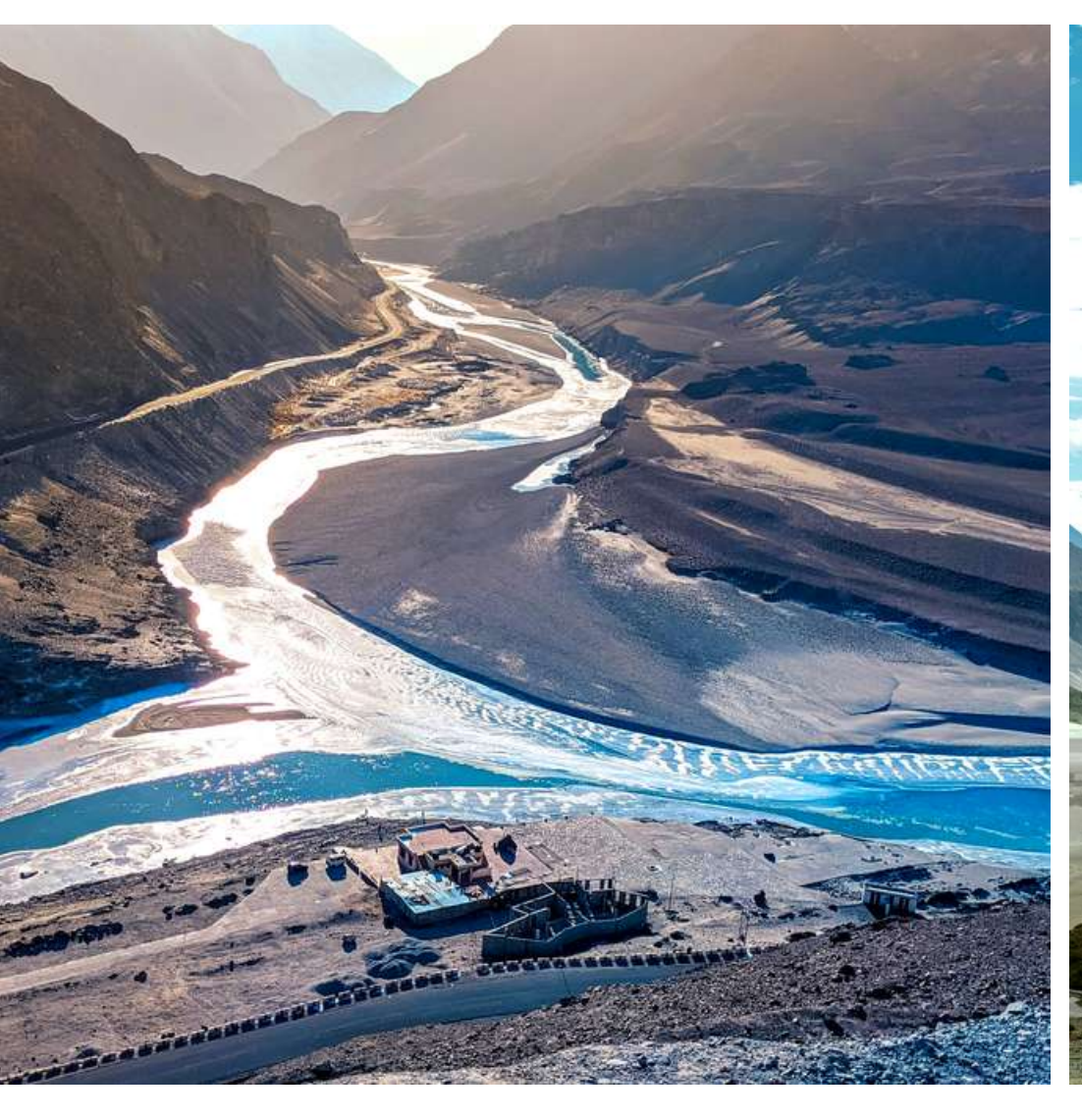
*plus 5% GST