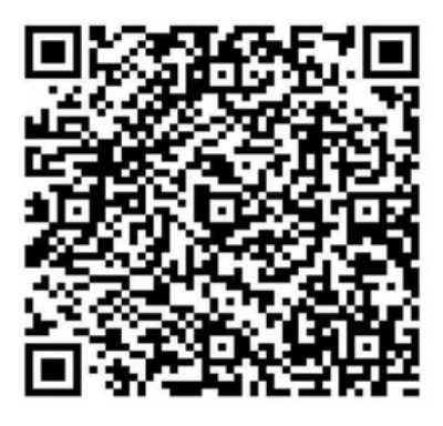
To Pay LAVIRAL KALRA