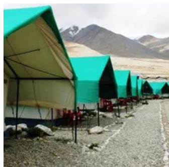
100 Sky Camp