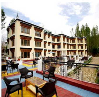
Hotel Khaksal Chubi