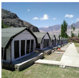
Nubra Summer Camp