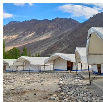
Valley View Camps