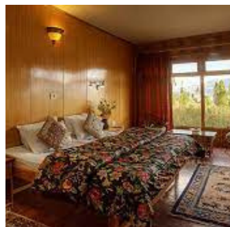
The Oriental Ladakh