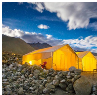
The Ladakh Camps